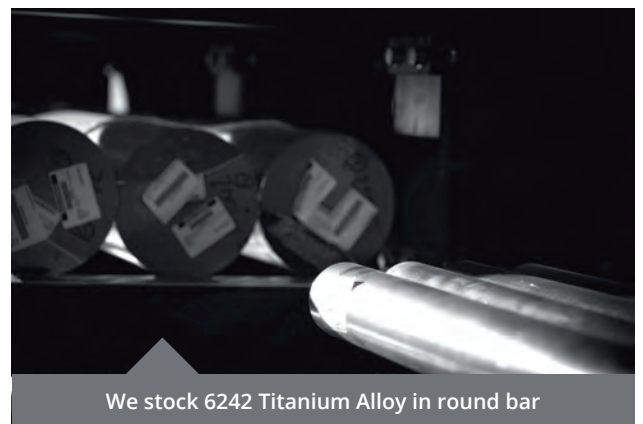
We stock 6242 Titanium Alloy in round bar