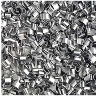
TYPICAL SigmaChip A6 Chips

Short, tightly curled chips and rapid metal removal rates ensure greatly reduced machining times over all-purpose grades such as 6082/H30, together with an excellent, bright surface finish. These attributes are combined with very good anodising and corrosion resistance.